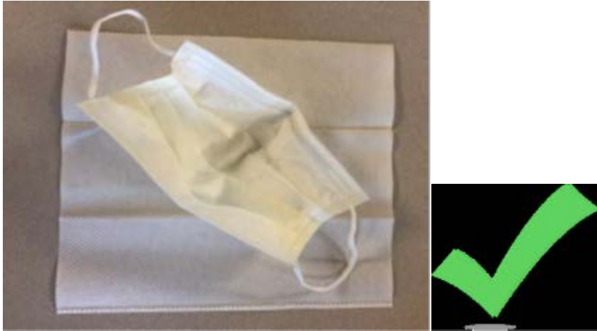
Figure 2 – This image shows the correct way to store mask when not in use. Notice the exterior of the mask is facing DOWN.