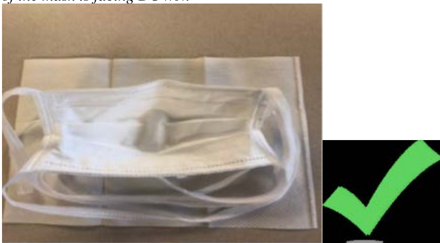
Figure 3 - This image shows the correct way to store a surgical mask when not in use. Notice the exterior of the mask is facing DOWN and ties are placed carefully away from the inside of the mask