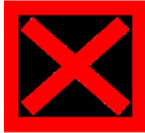
This image demonstrates the wrong way to wear a mask. The nose should be covered at all times.